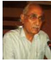
PP R.K. Luther Skill Development Program