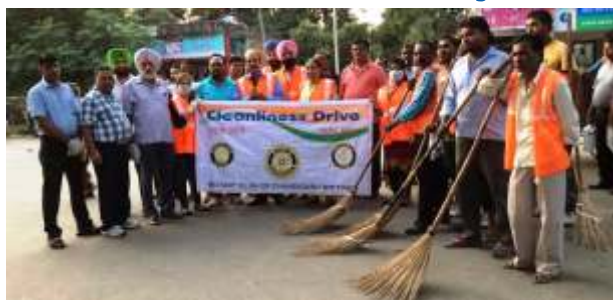
7th September 2015