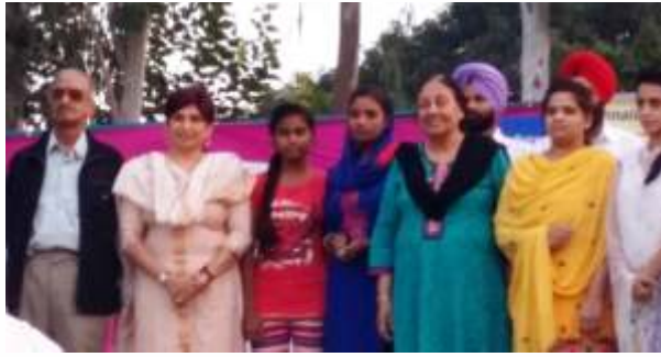
Certificate of computer course to 12 participants