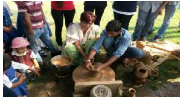
Pottery workshop at Kartar Aasra Orphanage