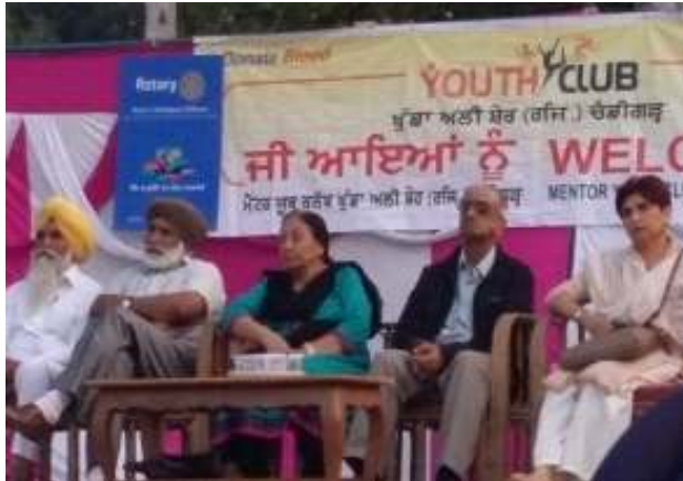
Honoring the multiple blood donor at RCC Khuda Alisher