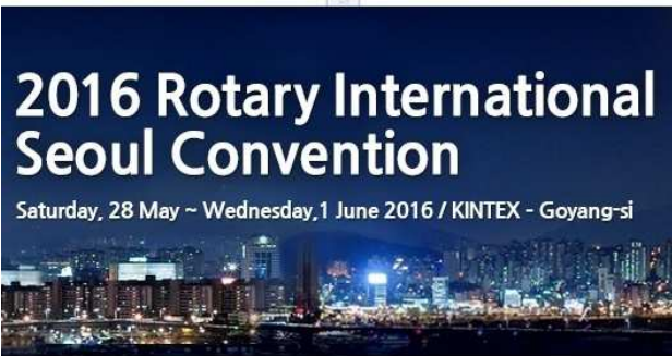
9 registrations from Chandigarh Midtown.....