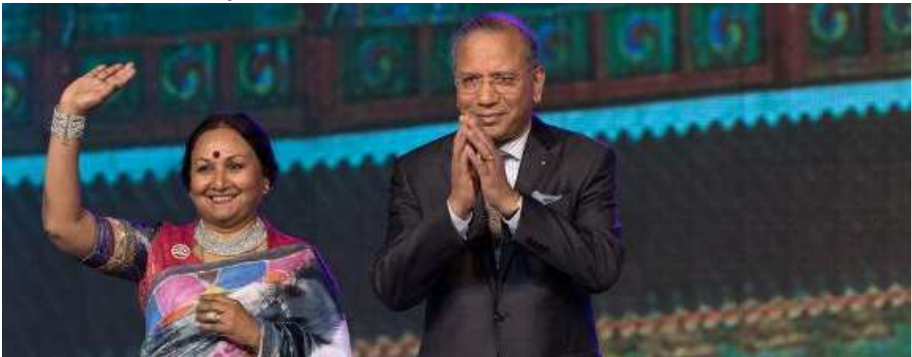
RI President K.R. Ravindran and Vanathy, address the audience during the opening session of the Rotary Convention in Korea on Sunday, 29 May 2016