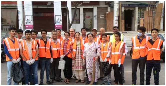
Swachh Bharat campaign in full swing with support from Municipal Corporation of Panchkula whose rep is in yellow colour jacket