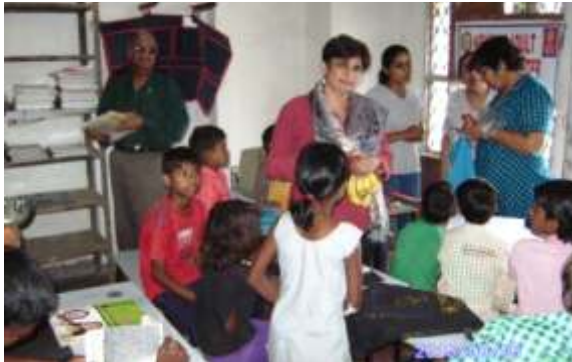
Books donated at Nevedac Literacy Centre, Zirakpur. Stationery and fruits being distributed to students