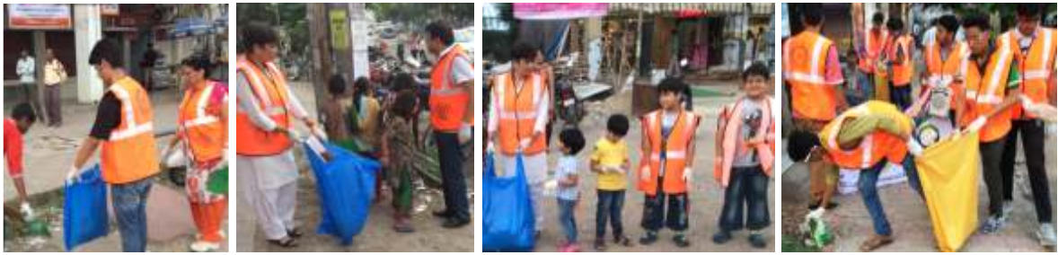
Rotarians in action