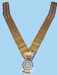
Presidential Collar of Rotary Chandigarh Midtown